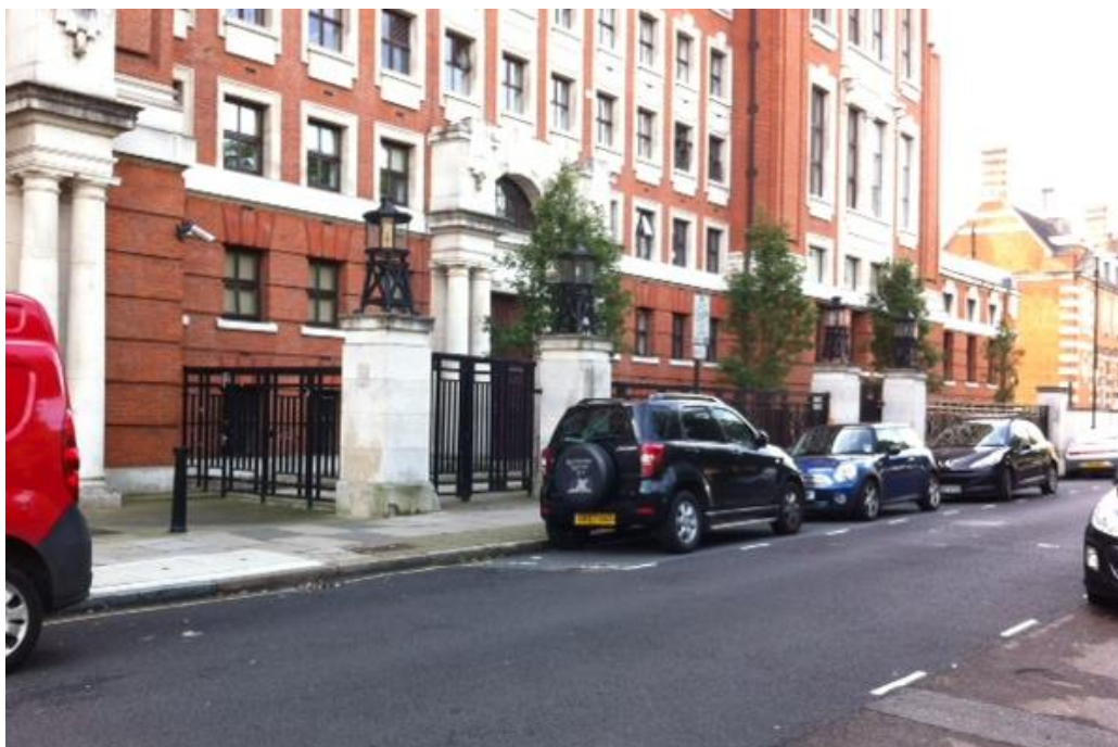
Photo 3: View of landscaping area in front of proposed residential unit