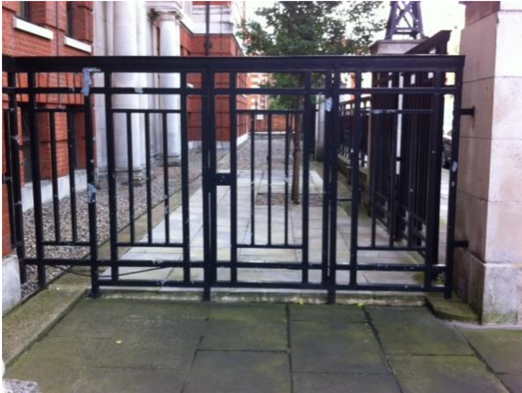
Photo 4: View of landscaping area in front of proposed residential unit