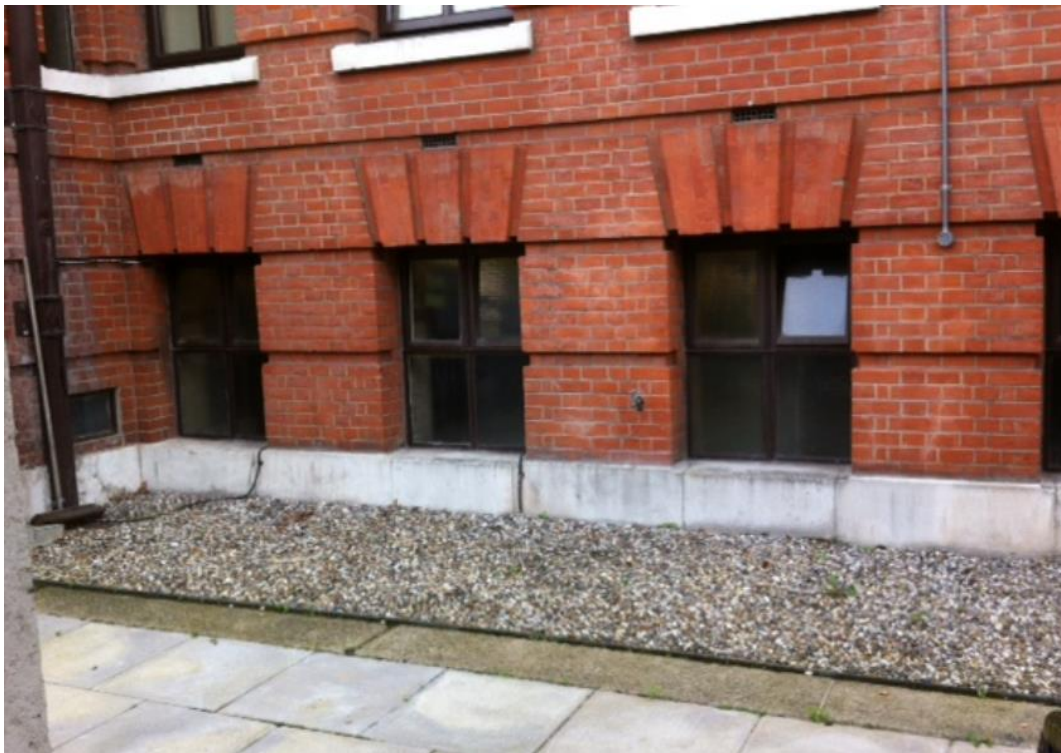
Photo 5: View of landscaping area in front of proposed residential unit